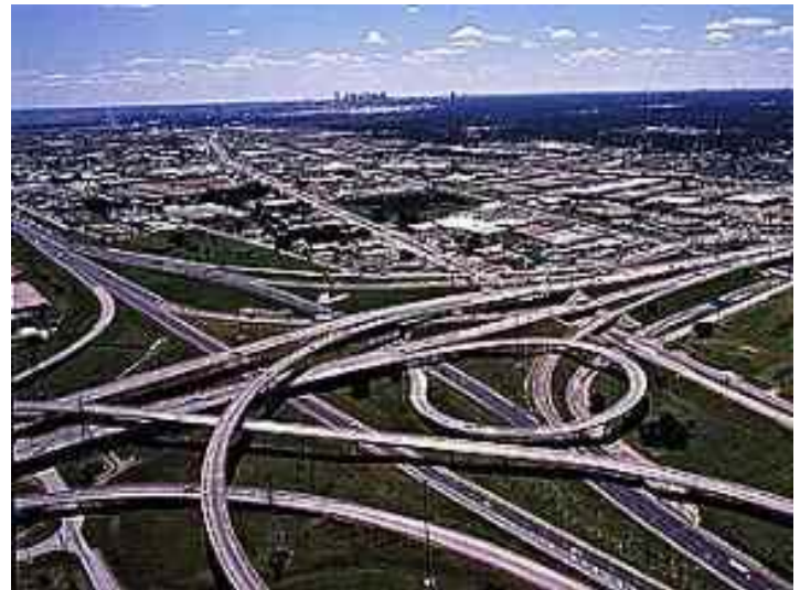
At spaghetti intersection, one better not have too many meatballs.

Coastal property scored a 3.9, just below difficult market, followed closely by gen-